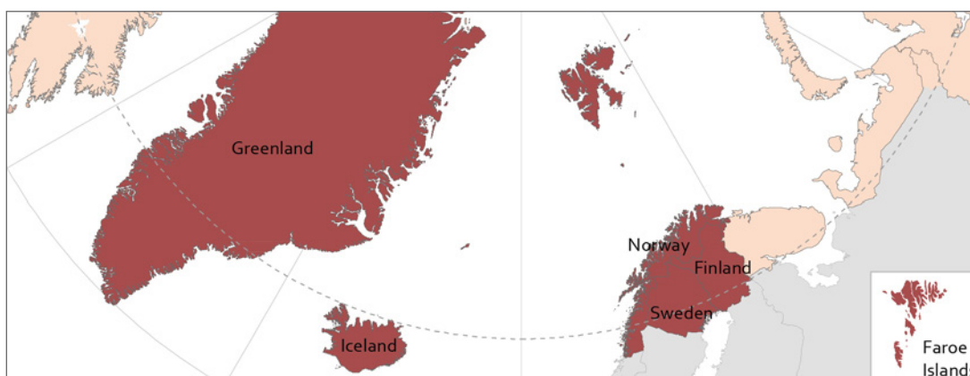
Map 1. The Nordic Arctic region includes the area in red: Faroe Islands, Iceland and Greenland and the Northern most regions of Finland, Norway, Sweden. Map: Julien Grunfelder, Nordregio.